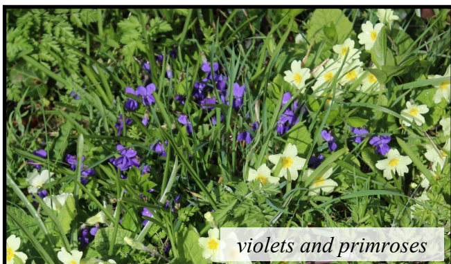
violets and primroses