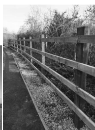
AGRICULTURAL & EQUESTRIAN