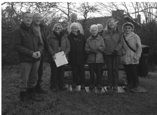
Health Walkers on the Green, ready to for a walk around Curry Rivel