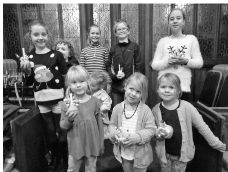
Some of the children with their Christingle, after the service in St. Andrew's.

In these boxes an amazing £1,308.19 has been collected in 2018. At the Christingle services in St. Andrew's and the School a further £191.90 and £135.87 respectively was donated — altogether an excellent result.