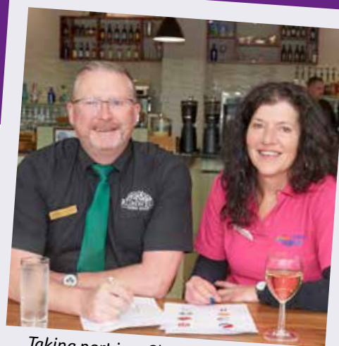
Taking part in a Charity Quiz night at Rumwell Farm Shop © Rumwell Farm Shop.

www.ageuksomerset.org.uk/fundraisingevents